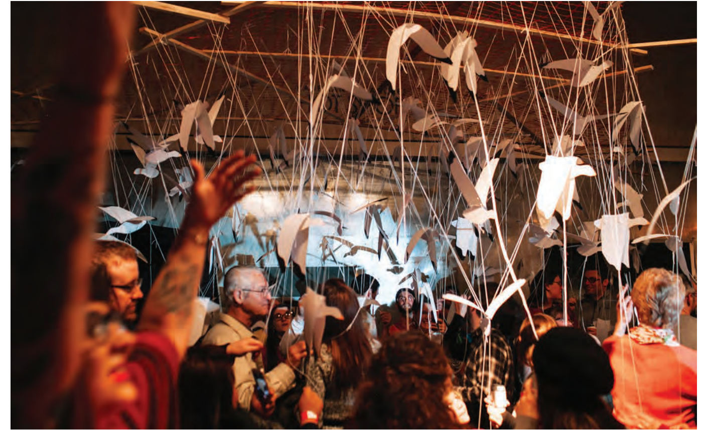
Flock the Optic in an interactive performance at the Chrysler Glass Studio, 2016.