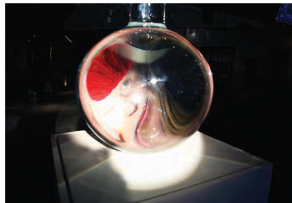
Flock the Optic, WaterLens Project, 2016.

While collaboration is an inherent aspect of hot glass work, the named performance troupe as an artistic format seems to be phasing out in favor of explorations by individual artists into the performative aspects of glass, harkening back to earlier experiences with sound, video, and the stage. The continuation of institutional programs like the Perry Studio’s Third Thursday series, provides the structure (both facility and assistants) through which artists can produce performance. With a system of support and recognition in place, individuals have increasingly taken up the mantle of the performative within glass, and what started as a niche within the larger glass field has increasingly become a dominant mode of making with the material. This development will be discussed in the final article of this series considering the work of individuals and the new systems of support that have emerged. ■