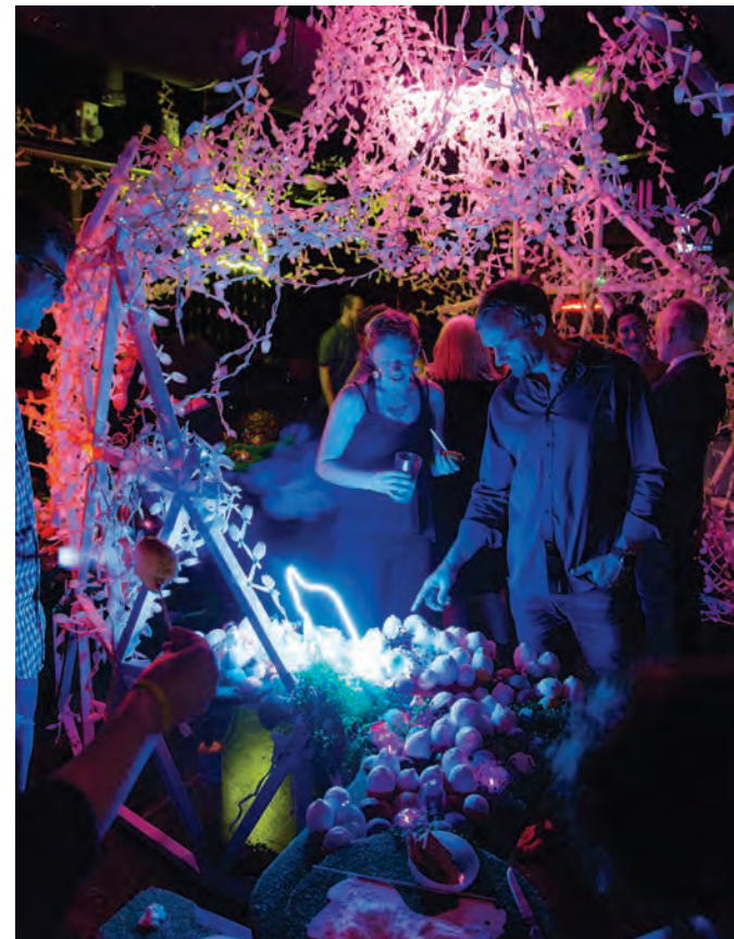
Audience members eating a cast marshmallow chicken with a red velvet cake stomach attached to a neon wing during the performance Around the Campfire by the Burnt Asphalt Family, Chrysler Museum of Art, 2016.

The Butter Eaters’ stunts—perhaps a more apt word than performance—have included the unexpected swapping of water for lubrication, making the use of the blowpipe nearly impossible; eating a full pizza off the body of another member like a “pack of wolves eating carrion”; and a complete abandonment of technique, including one demonstration where the group purposefully did everything entirely wrong, to the chagrin of the audience. As put by Elek, “When set free on a shop, we did just that, we got loose.... We were a group that loved each other, blowing glass, sharing food, riding bikes, and ... punk rock shows. Our artistic activities mirrored our time and place.” 9