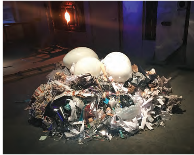
Flock the Optic, Temporary Nest sculpture (produced as part of the Unlimited Riotous Bubbles and Noise performance at UrbanGlass), 2019.

video, music, installation, and sculpture as well as zines. They also deliberately decenter glassblowing as a performative expression, opting to work with glass (a material the trio have all been trained in) in tandem with found objects and recycled materials, combining them into new works. Playfulness and interactivity take center stage in experiences that are imaginative and open to interpretation, or, as they were once called, “esoteric, but charming.” 22 Flock the Optic performances have included disco-ball sculptures and, true to their name, flocks of seagulls in video form and as a gallivanting crowd flourishing kinetic paper birds on sticks.