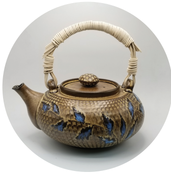
Ceramic teapot by Polina Miller Pottery, an exhibitor at the American Craft Made Baltimore Marketplace 2023