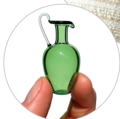
Tiny pitcher by Kiva Ford, as included in the Spring 2023 issue of American Craft

Writers, photographers, and contributors engaged to produce American Craft