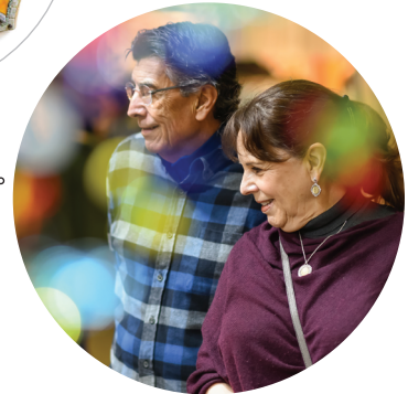
Shoppers at the American Craft Made Baltimore Marketplace 2023